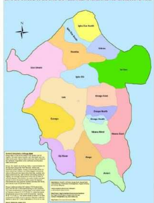
ENUGU STATE 18 LOCAL GOVERNMENT AREA ADMINISTRATIVE MAP