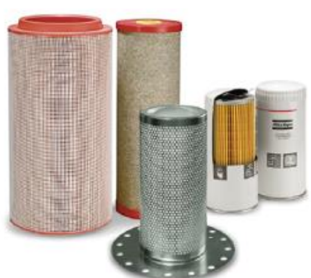
Air Filters, Fuel Filters, & Oil Filters

Proper Maintenance is an integral part of owning equipment to keep it dependable. Thus, we are with our customers in a common understanding the proper support they need to extend the useful life of their machines.