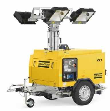
Model: QLT-H40 Lighting Tower with Hydraulic Mast up to 9meters