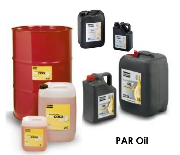
PAR Cool Packed in: 5L, 10L, 21L, 22L, 210L

By having all of this, JG-RIDS is able to help you build your Capital Equipment arsenal and prolong the useful life of your machines while we assist you in making your business grow into the next level.