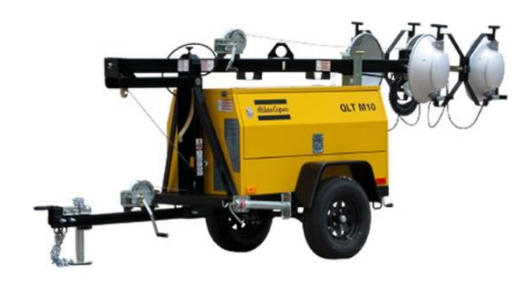
Model: QLT-M10 Lighting Tower with Manual Mast