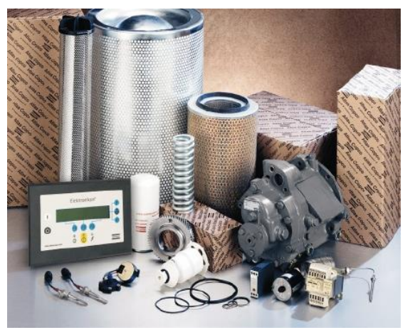
Wear & Maintenance Parts