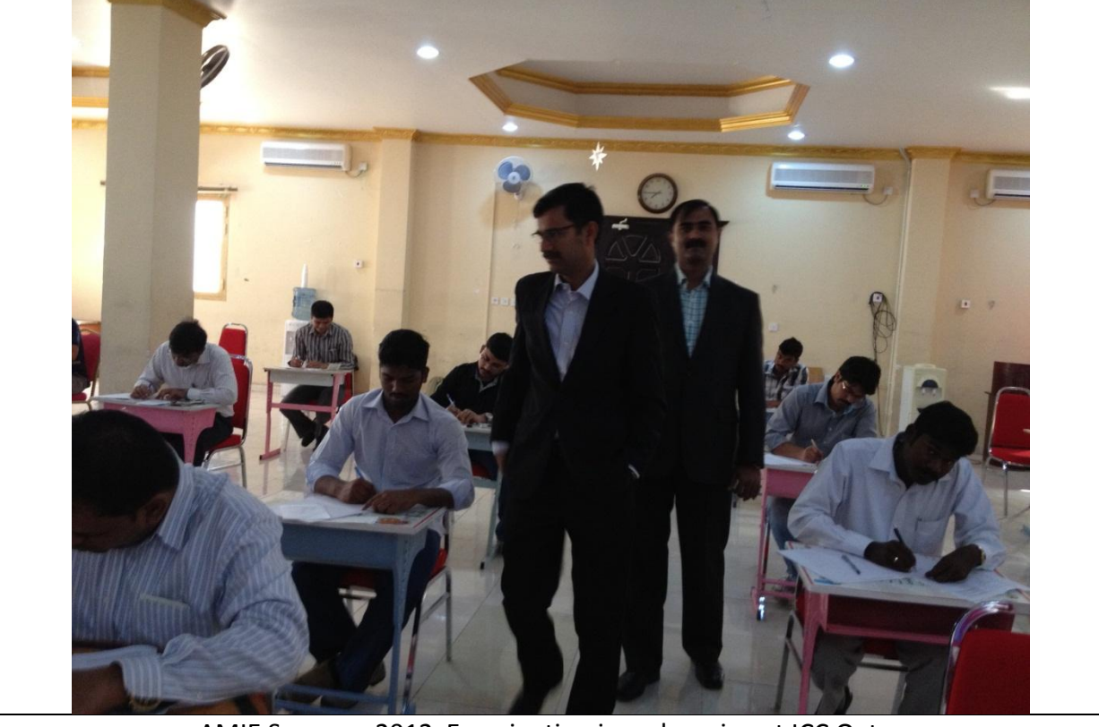
AMIE Summer-2012 Examination is undergoing at ICC Qatar