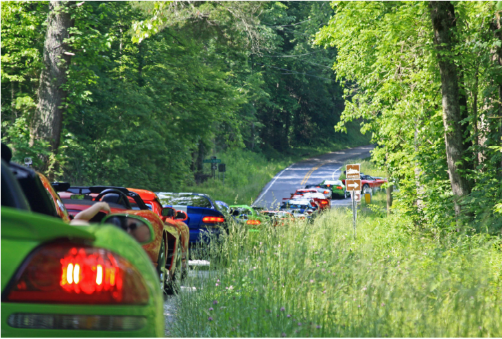
(Above) Snakes lined up for a short stop near Deals Gap on the way to the “Tail of the Dragon” on Friday afternoon.