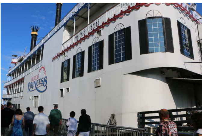
(Above) Boarding the "Detroit Princess." The Carolina's VOA was able to sit as a group in front of the corner window.