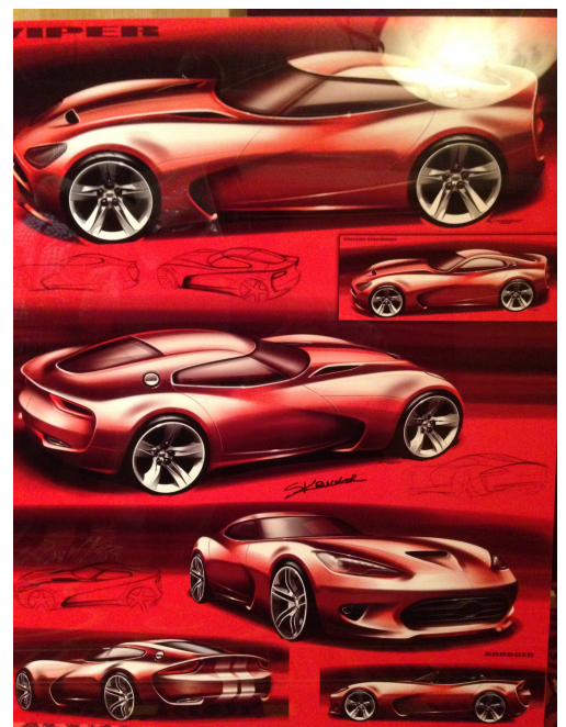
(Above) One of the auction items—original concept sketches for the Gen V Viper.