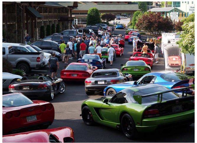
50+ Vipers pre-staged in front of the Greystone Lodge in preparation for the "Tail of the Dragon."