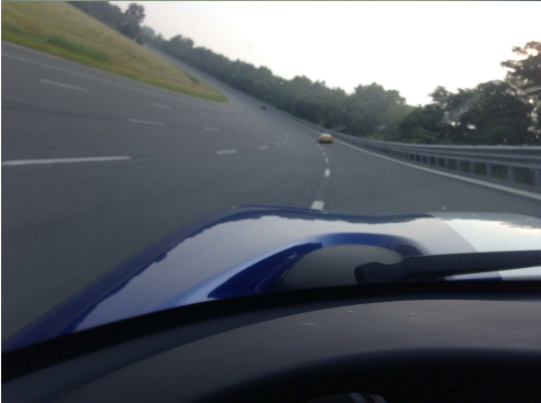
(Middle Left) Cockpit view going around the turn)