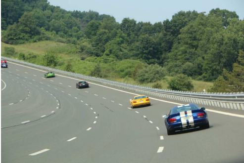
(Upper Left) Vipers driving around the 2 mile oval. At 120mph the oval is a zero turn track with the outer-most lane at nearly 30 degree slope.

Saturday morning began with the vehicle inspection at Chelsea Proving Grounds where all the new Vipers are tested for performance and durability. The testing area includes a circle track, road course and everyone's favorite... the 2 mile oval. People were split up into groups to go to three different areas: 1. High speed oval; 2. Gen V Viper test drive; 3. Autocross course. After spending the day at Chelsea Proving grounds, the entire group returned to the hotel where we were picked up by a caravan of busses to transport all 500 people to a river boat named the "Detroit Princess." The boat was a great experience to allow groups to intermingle and sight-see along the river at the same time.