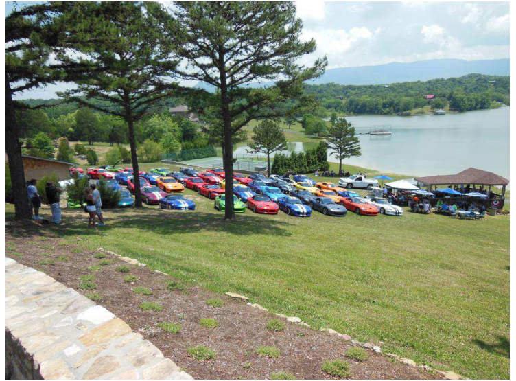
(Above) The beautiful view from the Ackley House where most of the club met after driving up 209 “The Rattler” on Saturday afternoon. A catered lunch was served underneath the gazebo and members ate at picnic tables or sat in the grass.