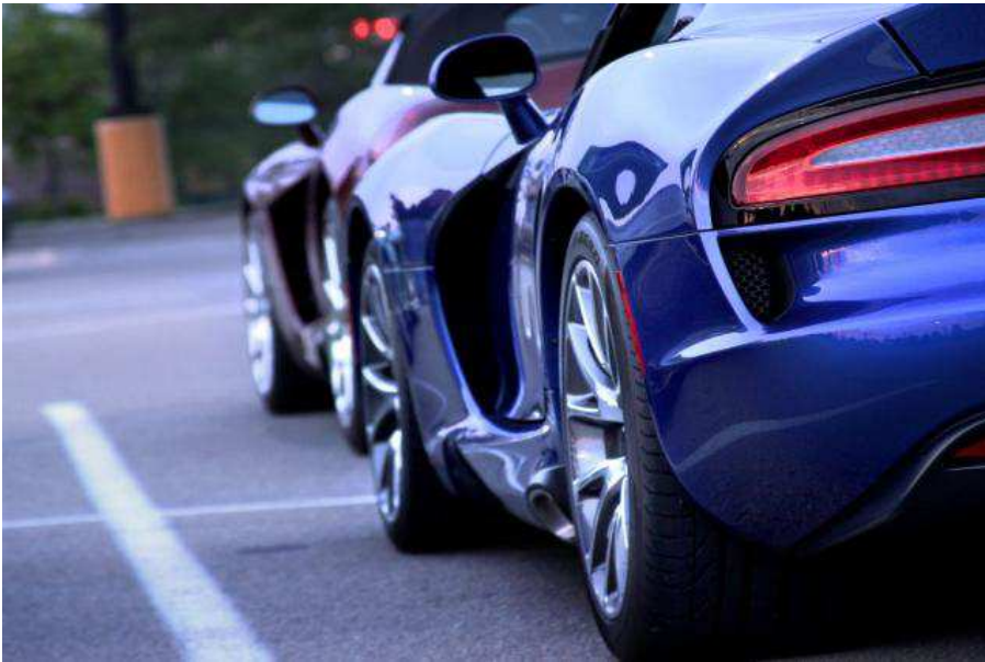
(Above) Vipers parked outside Prefix on Sunday morning before the unveiling of the Medusa.