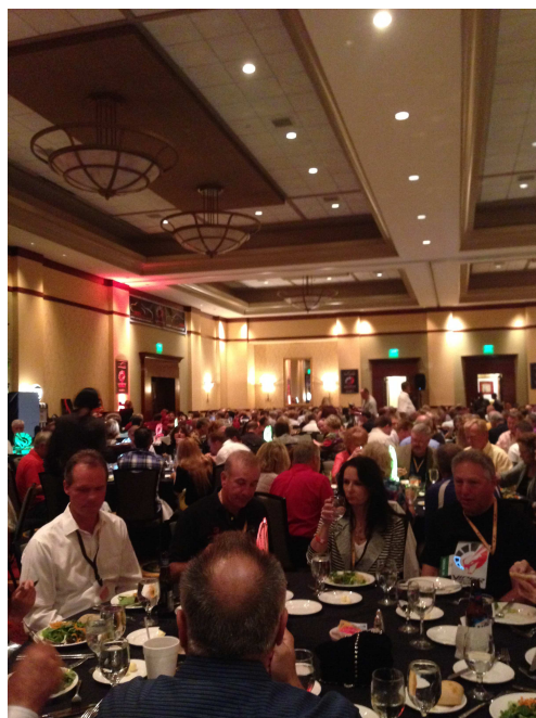
(Above) The dinner party where the drawing/raffle for the new Viper took place.