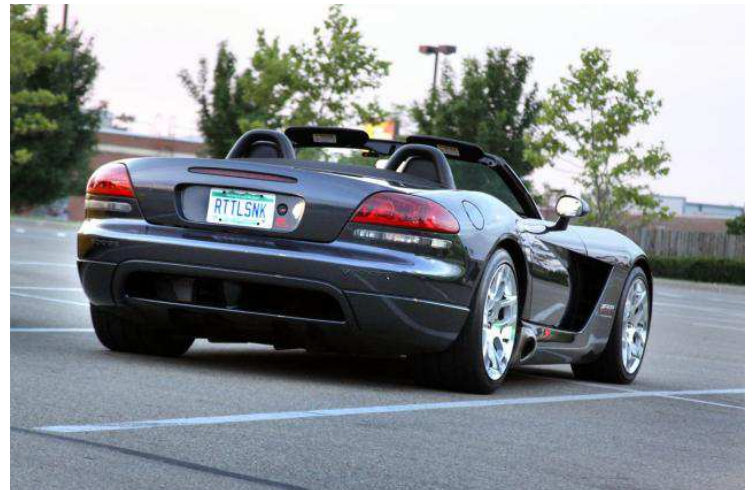
(Right) Angel's convertible SRT 10 waiting for events to take place at the track.