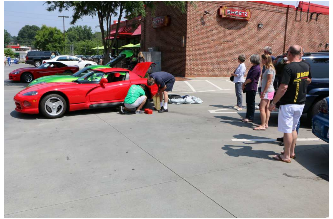
Changing out rear brake pads at one of the way-points along the way to Gatlinburg. Thanks to all who are well versed in Viper maintenance.

The cars staged in a staggered fashion in preparation for the parade. Every Viper in the nearby area came out to join in the parade. Gatlinburg Police cars escorted the Vipers through main street as the cars slowly drove through the city attracting the attention of all the people walking along the crowded city sidewalks. The parade ended at the Cherokee Grill at about 6:30. The group returned to hotel about 9:00 pm and a large portion of the club walked down the street to the rooftop Tiki bar that they had enjoyed the night prior. On Sunday June 1, most of the members woke up early, said their goodbyes and headed home, smiling the whole way.