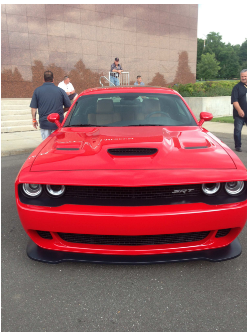
(Above) The newest member of the SRT lineup—Challenger Hellcat!