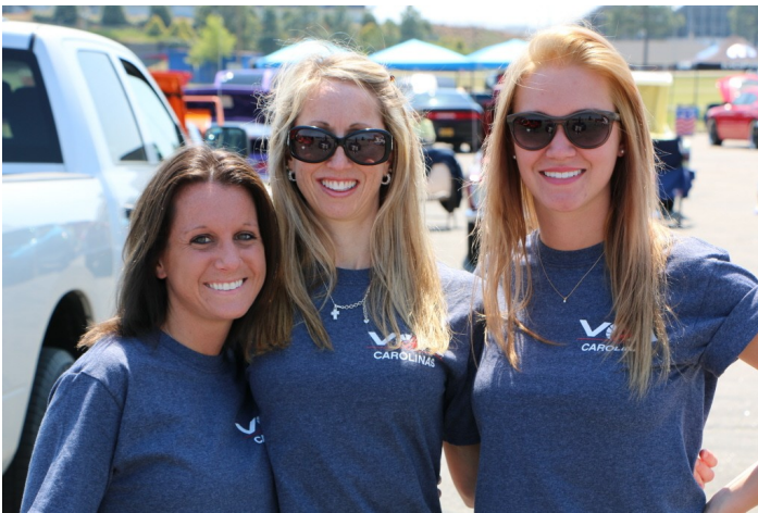
Brand new VOA T-shirts to show of club pride!