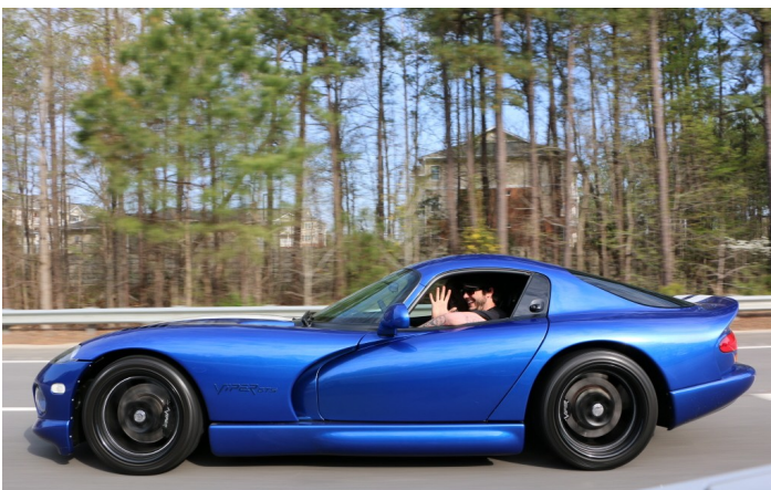
Caravan on the way to the Rock!