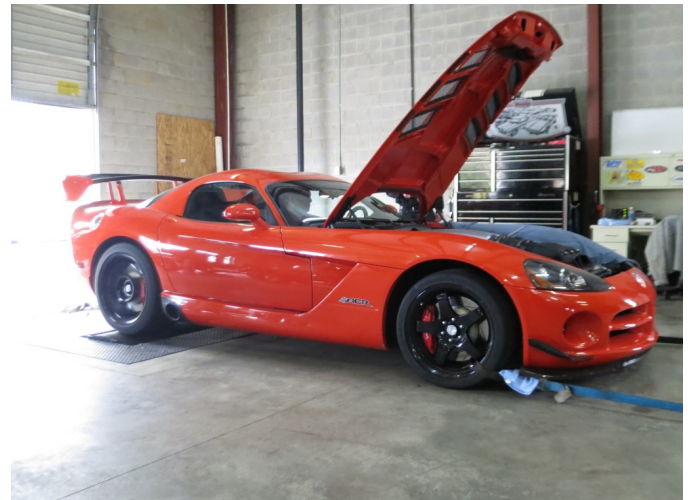
Henry's 2009 Hard Core ACR was the first Viper of the day to do a max power run. After resting and cooling for several hours, it increased 13hp from the first run.