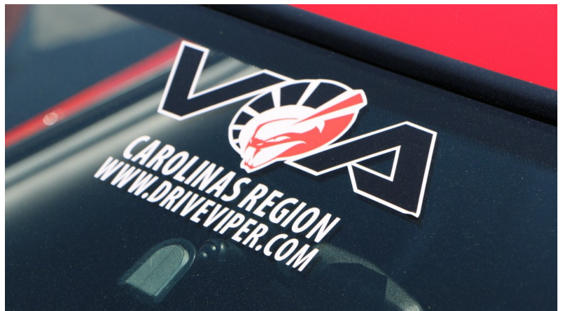
New "easily removable" Carolinas VOA windshield stickers