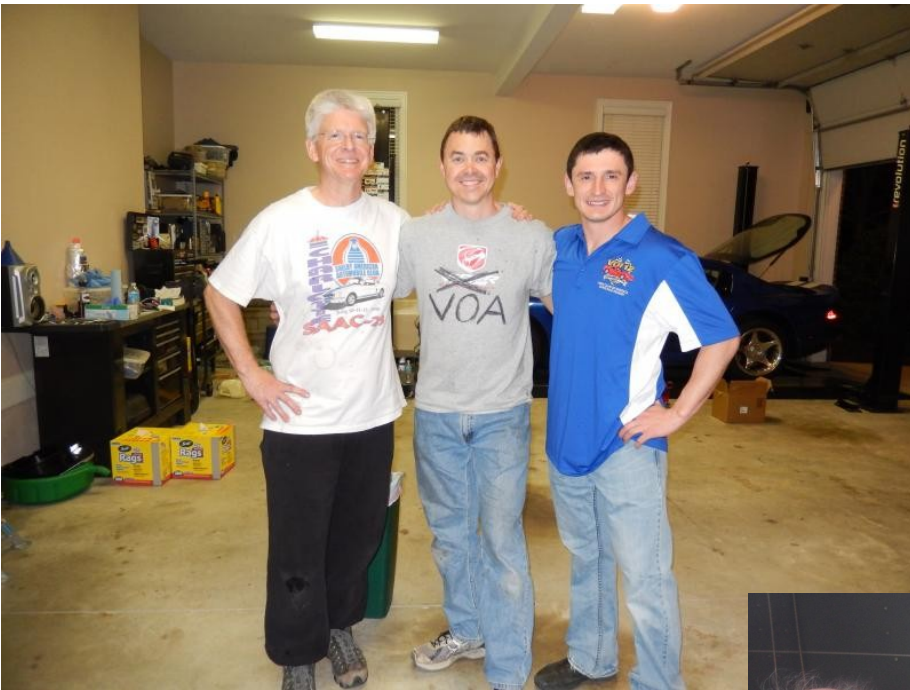
Last oil change finally finished well after dark.