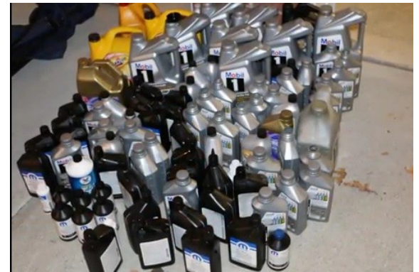
Empty oil bottles after the day was over.