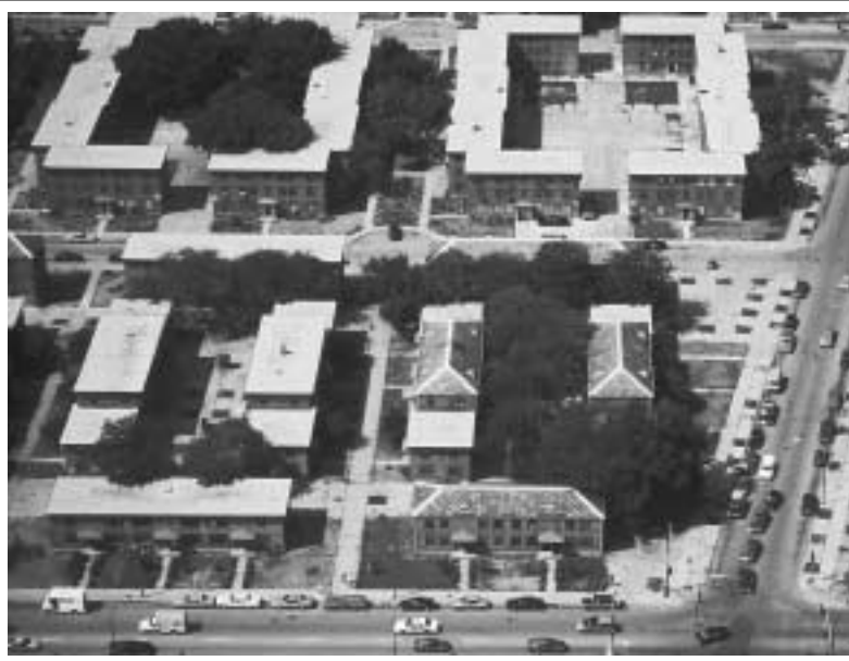
Figure 2: Aerial View of a Portion of Ida B. Wells Showing Buildings With Varying Amounts of Tree and Grass Cover

was full and the grass was green. For each building, the aerial slides were put together with slides taken at ground level; there were at minimum three different views from aerial and ground-level photos of each space (front, back, left side, and right side) around each building. Five students in landscape architecture and horticulture then independently rated the level of vegetation in each space. Each of the individuals rating the spaces received a map of the development that defined the boundaries of the specific spaces under study. The raters viewed the slides and recorded their ratings on the maps. A total of 220 spaces was rated, each on a 5-point scale (0 = no trees or grass, 4 = a space completely covered with tree canopy). Interrater reliability for these ratings was .94. 1 The five ratings were averaged to give a mean nature rating for each space. The nature ratings for the front, back, and side spaces around each building were then averaged to produce a summary vegetation rating. Ratings of vegetation for the 98 buildings ranged from 0.6 to 3.0.