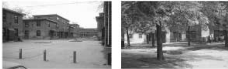
Figure 1: Ground Level View at Ida B. Wells Showing Apartment Buildings With Varying Amounts of Tree and Grass Cover

leaving some areas completely barren, others with small trees or some grass, and still others with mature high-canopy trees (see Figure 1). Because shrubs were relatively rare, vegetation at Ida B. Wells was essentially the amount of tree and grass cover around each building.